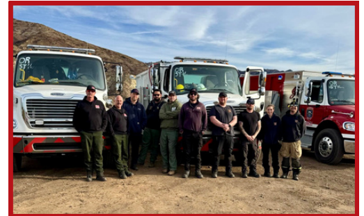
Coos/Curry Strike Team 16

The team works 24-hour grueling shifts, much of which is focused on extinguishing hotspots that are still smoldering. They make sure nothing kicks back up when the winds return, which has been daily, and they help to increase containment on the Palisades fires. The Santa Ana winds make the Southern Oregon coast winds look like a gentle breeze.