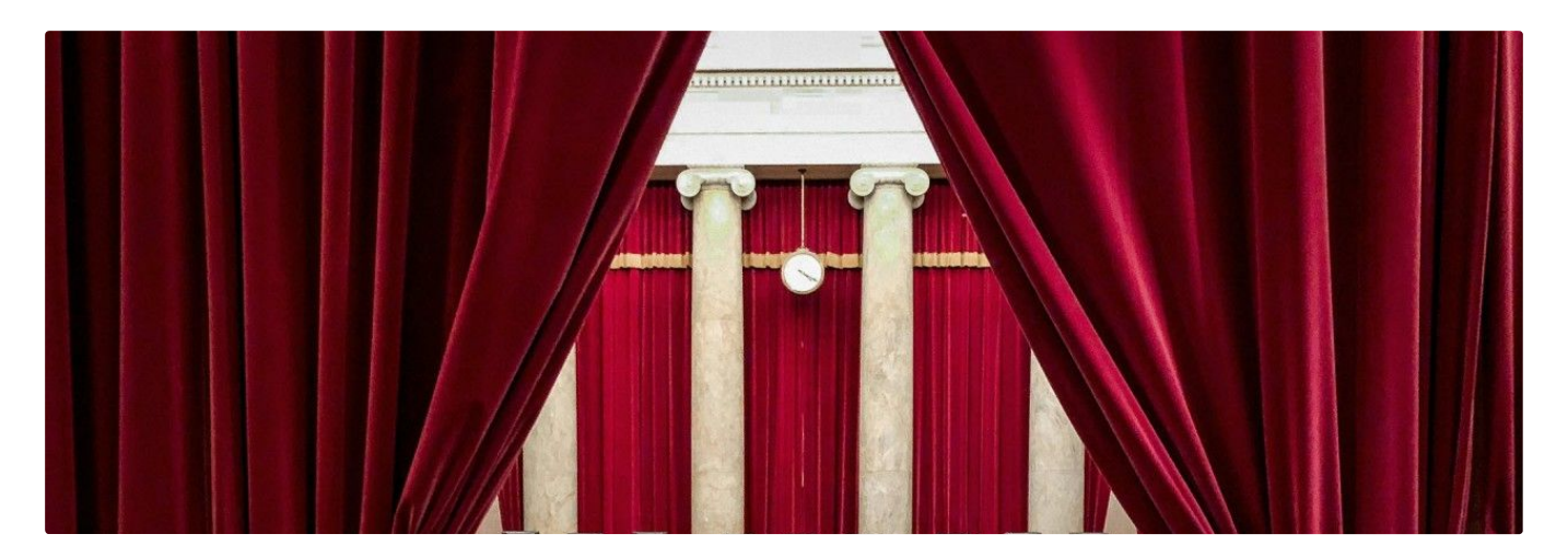
Supreme Court Debates Criminalizing Homelessness