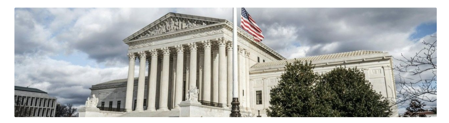
Top 10 Justice Questions on Homelessness Case By Phil Johncock