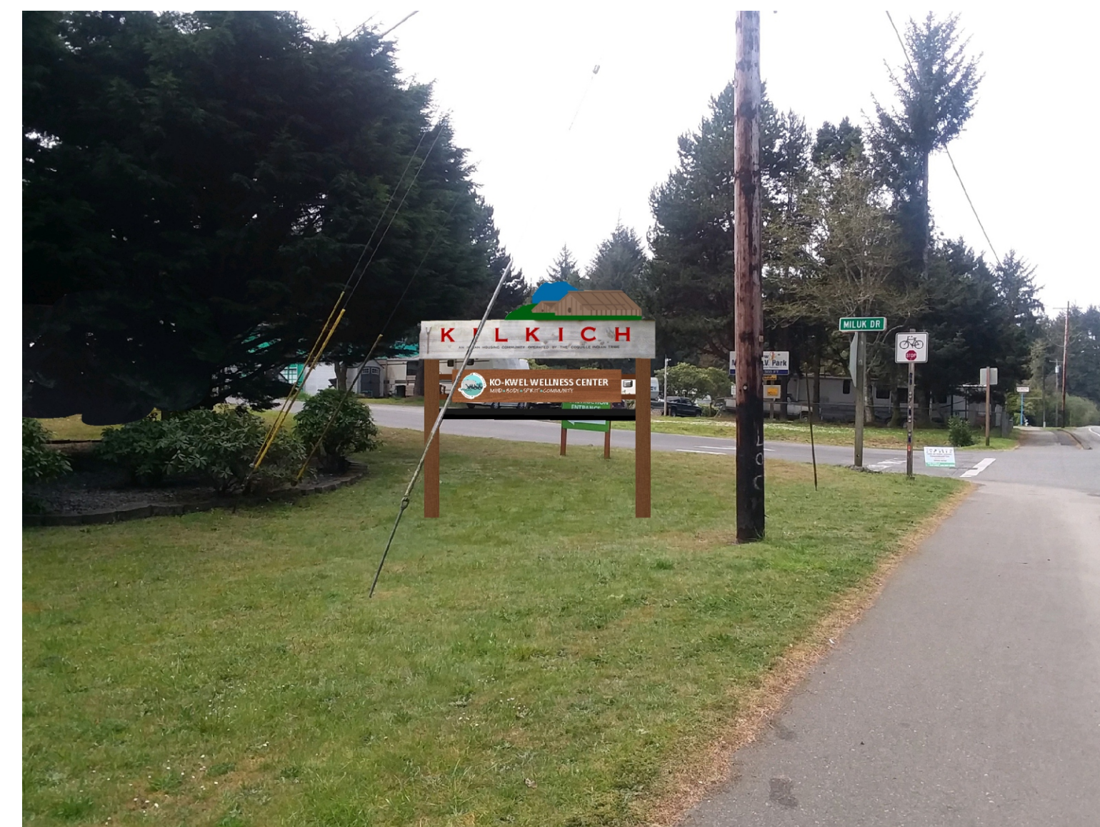
Photo Inlay Not Guaranteed to Scale