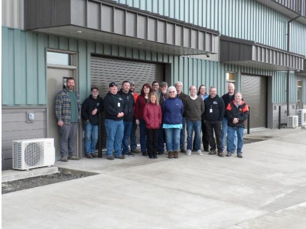
Board tour December 14, 2017.