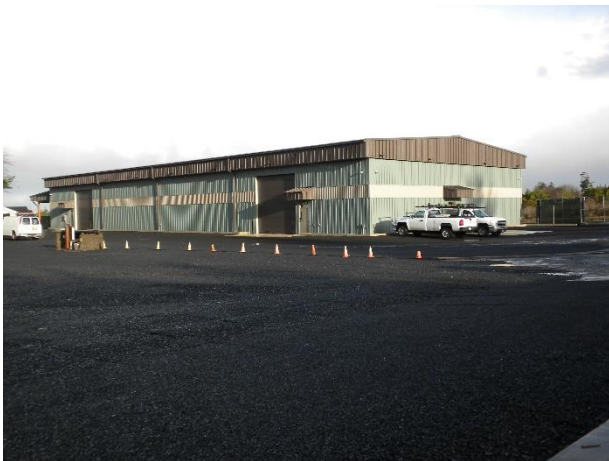
Improved surfacing inside compound.