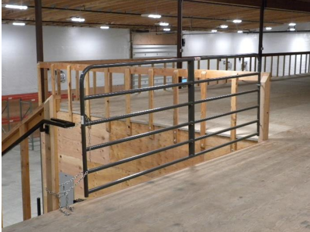
Mezzanine security gate.