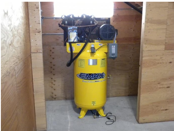
New air compressor.