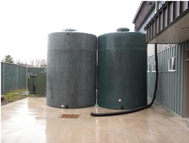
Rainwater collection tanks.