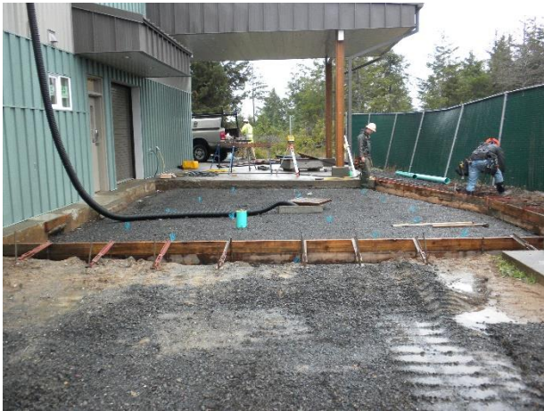
Pouring a pad for the water tanks.