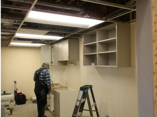
Installation of cabinets in utility area.