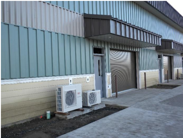
Exterior and roll up doors installed on rentals.