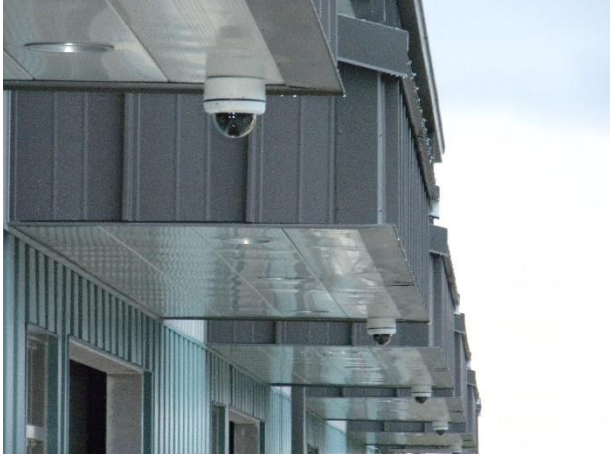
Security cameras at entries to rentals.