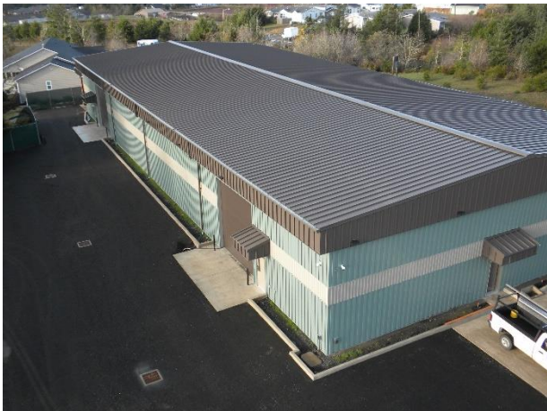
Overhead view of CIHA shop from Tribal shop.