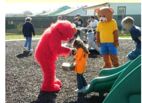
Elmo shares his goodies while the Share Bear watches

More Playground Pictures are available on the web at: www.coquilletribe.org Click on the Coquille Indian Housing Authority (CIHA) link.