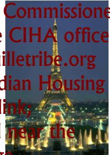
Caption describing picture or image

Applications are now being accepted for an opening on the CIHA Board of Commissioners. Applications are available at the CIHA office or on the website: www.coquilletribe.org Just click on the Coquille Indian Housing Authority (CIHA) link; the application is located near the bottom of the page. A General Statement of Duties is included with the application.