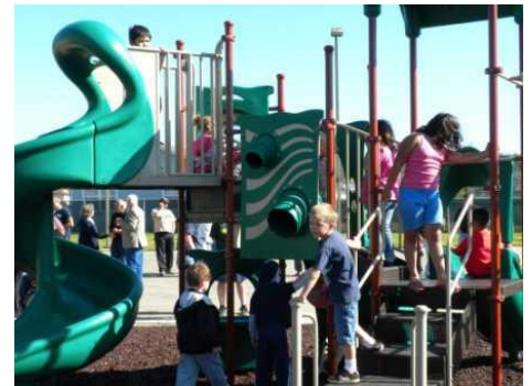
Everyone is enjoying the new playground equipment