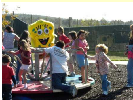
Sponge Bob takes a spin with his playground buddies