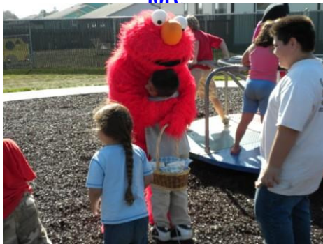
Elmo can't help but share a hug with one of his friends