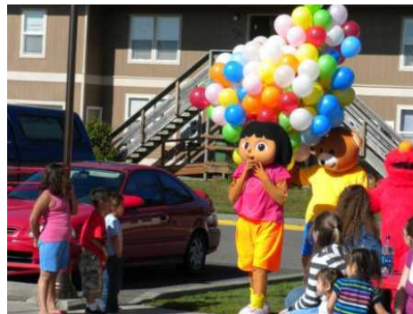
Here comes Dora, the Share Bear, & Elmo with balloons galore