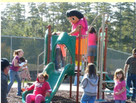
Dora the Explorer has fun exploring with the children