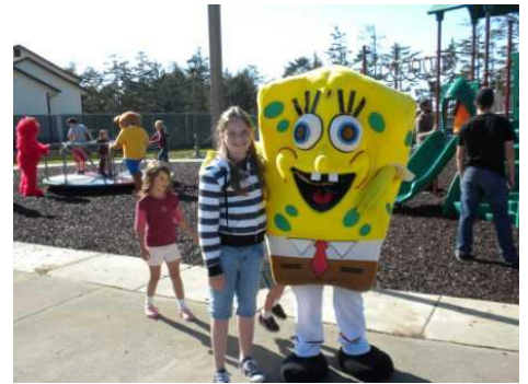
Sponge Bob takes a moment from the festivities for a photo shoot