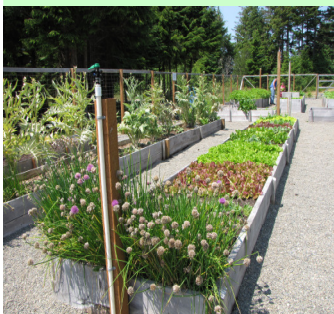
2012 Kilkich Community Garden

If you are interested in planting a vegetable garden this year, there are a few garden beds available in the Kilkich Community Garden. The beds will be assigned on a first-come, first-served