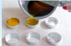
Create your own scent - the possibilities are endless!

Natural perfume-making is a creative and delicious way of expressing your own