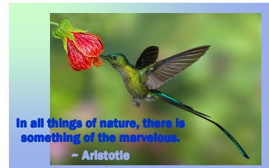
In all things of nature, there is something of the marvelous. - Aristotle

The 22 nd Annual Home and Garden Show will be held Friday, April 19 th through Sunday, April 21 st at 333 Walnut Avenue, Coos Bay. Hundreds of vendors will be on hand with creative and inspirational products and ideas. The entry fee is $3 per person; children 12 and under enter FREE. The venue is open Friday, 4:00 p.m. - 8:00 p.m.; Saturday, 10:00 a.m. - 6:00 p.m.; and Sunday, 10:00 a.m. - 4:00 p.m. For additional details or more information call 541-297-3319.