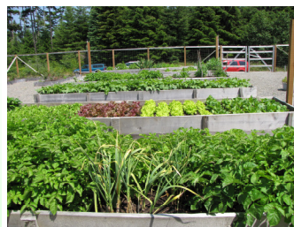
2012 Kilkich Community Garden

If you are interested in a garden bed, please call the CIHA office by Friday, April 19 th at